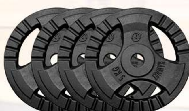
4x PLATES 5 KG