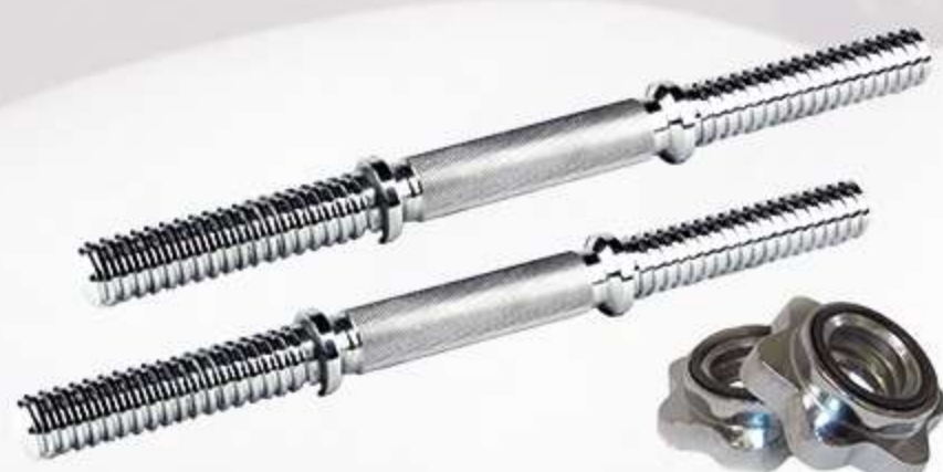
BARBELLS FI 28 MM/40 CM WITH SPINLOCKS