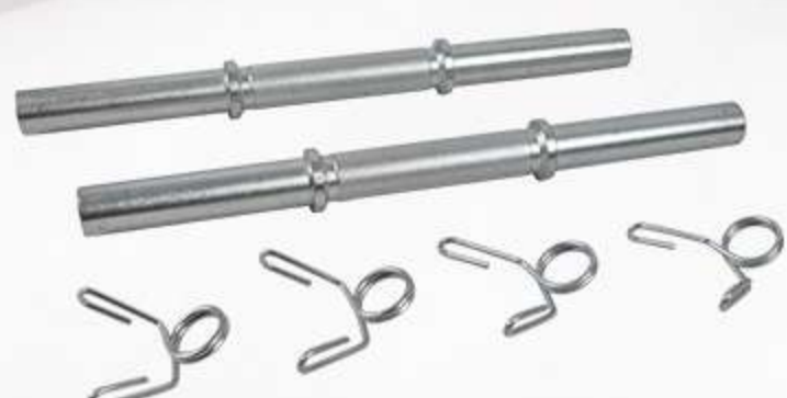
BARBELLS KAWMET FI 28 MM/40 CM WITH SPRING CLAMPS

Weight plates made of high quality cast iron, carefully finished making it suitable for both commercial and home gyms. Tri-Grip Design allows you to quickly change to a rod or neck. Dumbbells come with the spring clamps which characterizes in very high clamping power - so you can be safe about your training routines. The plates won't come off that easily.