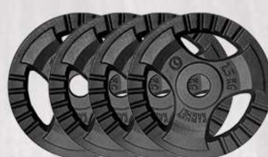
4x PLATES 2,5 KG