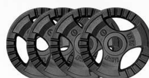
4x PLATES 1,25 KG