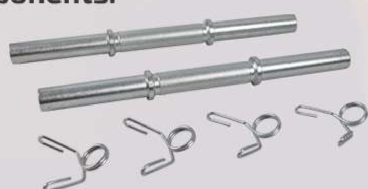
BARBELLS KAWMET FI 28 MM/40 CM WITH SPRING CLAMPS