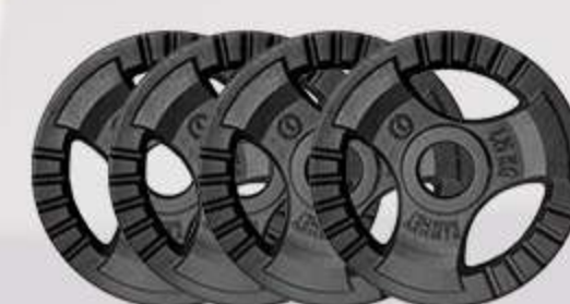
4x PLATES 1,25 KG