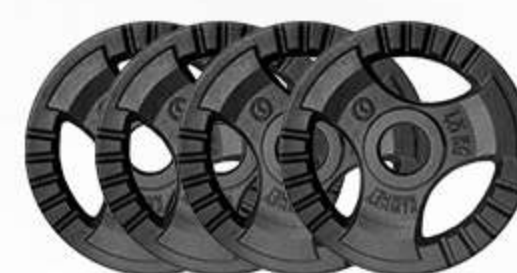
4x PLATES 1,25 KG