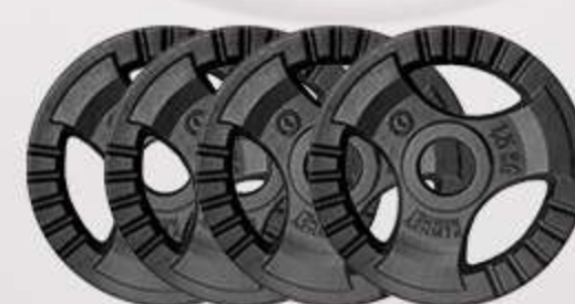
4x PLATES 1,25 KG