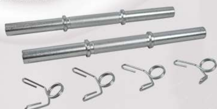
BARBELLS KAWMET FI 28 MM/40 CM WITH SPRING CLAMPS