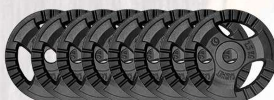
8x PLATES 2,5 KG