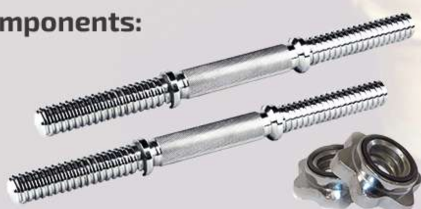
BARBELLS FI 28 MM/40 CM WITH SPINLOCKS