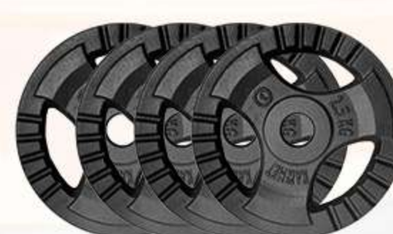
4x PLATES 2,5 KG