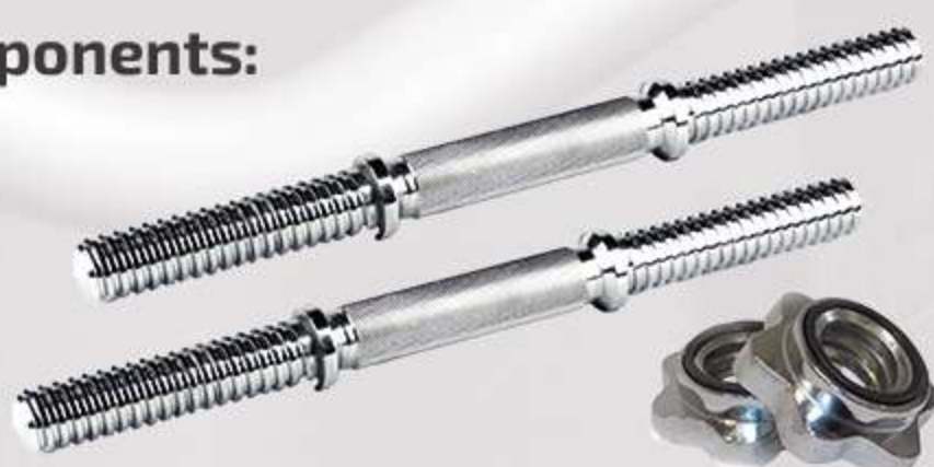
BARBELLS FI 28 MM/40 CM WITH SPINLOCKS